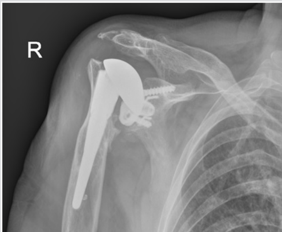
Figure 1. Right shoulder prosthesis dislocation

A right shoulder x-ray confirmed prosthesis dislocation (Fig. 1).