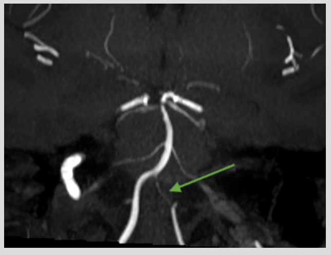
Fig 3. Angio-MRI showing a left vertebral artery dissection in V4 segment