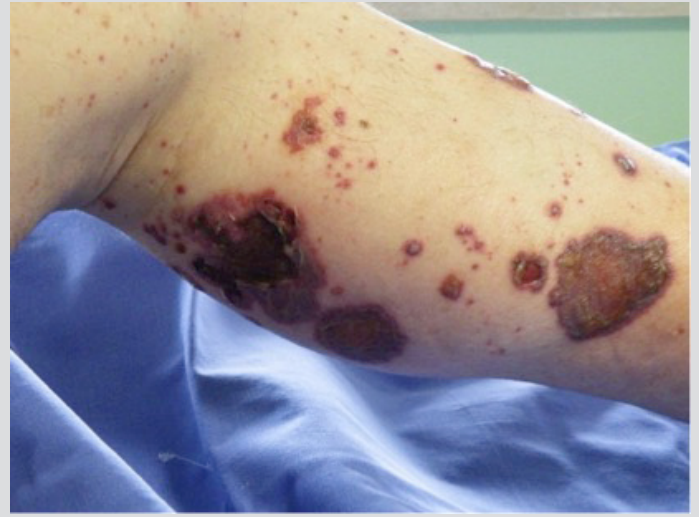
Figure 2. Purpuric lesions with ulcers