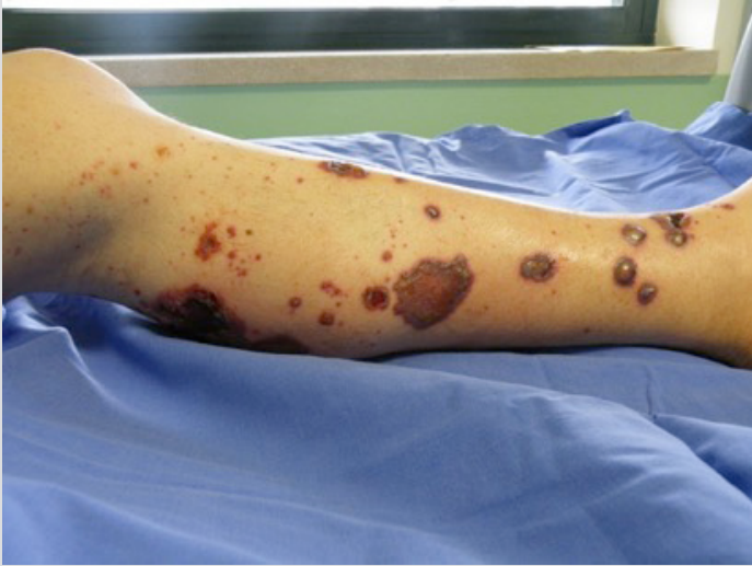
Figure 1. Purpuric lesions with pustules and necrotic tissue

and hypodermis with focal signs of vasculitis (Fig. 4), compatible with polyarteritis nodosa. The patient was treated with prednisolone, starting with 60 mg followed by progressive dose reduction, with complete remission of the skin lesions.