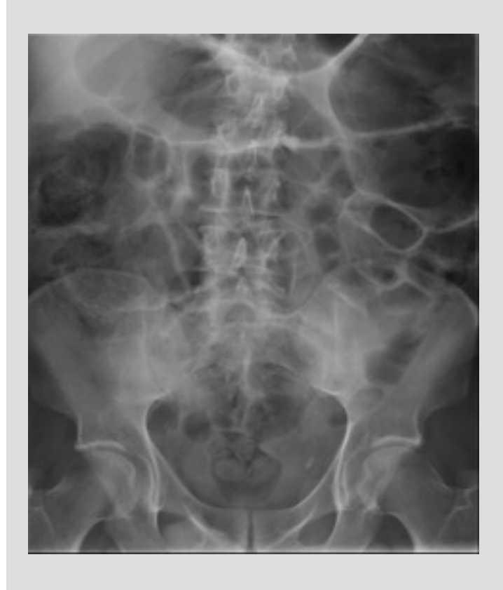
Figure 3. Abdominal radiograph showing dilated bowel loops