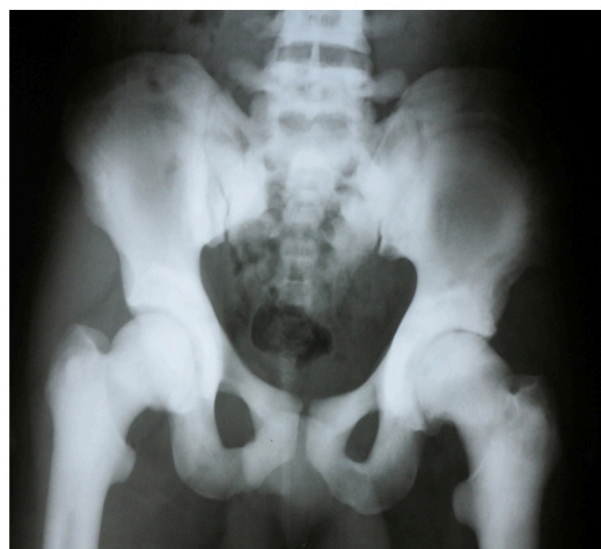
Figure 2 AP pelvis graphy demonstrates diffuse sclerotic pelvic bones

Physical examination showed other systems were normal and psychomotor development was also normal. A plain radiograph of the spine showed end-plate thickening and sclerosis producing the classic "sandwich vertebra" appearance (Figs.1,2).