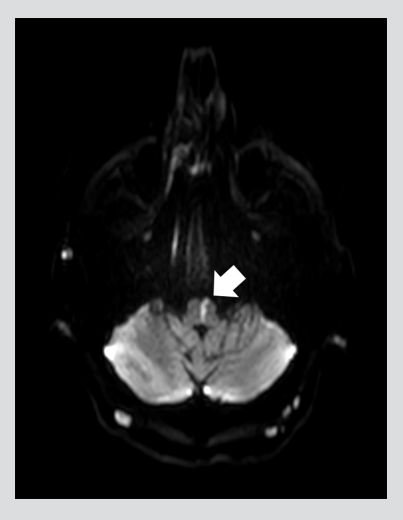
Figure 2. Diffusion weighted MRI image showing an infarct (white arrowhead) in the acute phase midline medulla and left pyramid