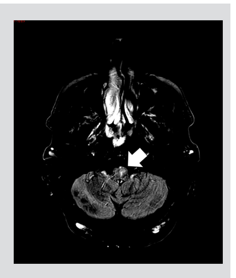
Figure 3. T2 FLAIR MRI image showing an acute infarct (white arrowhead) in the midline medulla and left pyramid