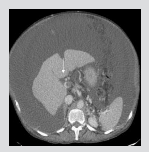
Figure 2. Abdominal CT showing portal vein thrombosis (PVT) (>50% of the lumen) extending to the left and right intrahepatic branches (arrow)

Abdominal computed tomography (CT) showed portal vein thrombosis (PVT) (>50% of the lumen) that reached the left and right intrahepatic branches ( Fig. 2 ). The coagulation tests excluded thrombophilia. Anticoagulant therapy was not initiated due to the high variceal bleeding risk. At that time, the patient stopped alcohol consumption, and a pre-liver transplant study was carried out. Unfortunately, the patient was not elected for transplantation due to the extent of PVT (including the superior mesenteric vein) ( Fig. 3 ).