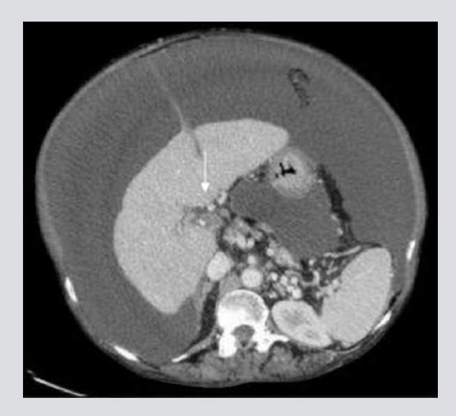
Figure 3. Abdominal CT, a few months later, showing complete portal vein thrombosis (PVT) (arrow)