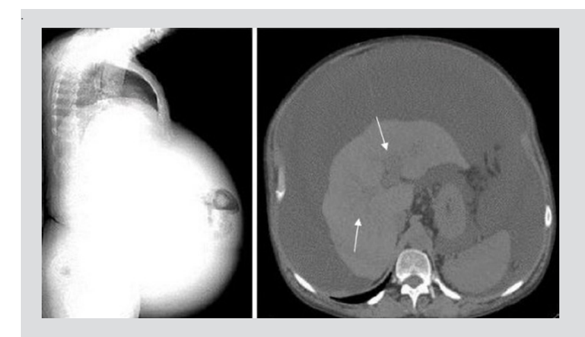
Figure 1. Abdominal CT showing a cirrhotic liver with no focal lesions, a large volume of ascites and a patent portal vein (arrows)

A 63-year-old white woman presented with alcohol-related liver disease diagnosed 15 years previously. She had a significant medical history of long-term chronic alcohol abuse (~90 g/day), arterial hypertension, dyslipidemia and hyperuricemia; no history of blood products transfusion, illicit drug injection, or other liver disease risk factors; and no medical follow-up. Five years after her earlier diagnosis, following hospital admission for traumatic brain injury, the patient initiated regular medical monitoring. By that time, she was Child-Pugh class B (8 points) with a MELD score of 13. Liver study excluded other viral, autoimmune and metabolic aetiologies. During the following 2 years, the patient experienced clinical deterioration with severe malnutrition, a performance status of 4 and multiple hospital admissions due to decompensation including refractory ascites ( Fig. 1 ), recurrent hepatic encephalopathy, variceal bleeding (oesophageal and rectal) and hyponatremia, and also infections (sepsis and spontaneous bacterial peritonitis).