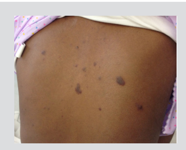
Figure 1: Violaceous nodules and plaques suggestive of Kaposi's sarcoma on the back of the patient.

The patient was admitted to hospital where an HIV antibody test, serial sputa test for acid-fast bacilli and blood culture tests, including