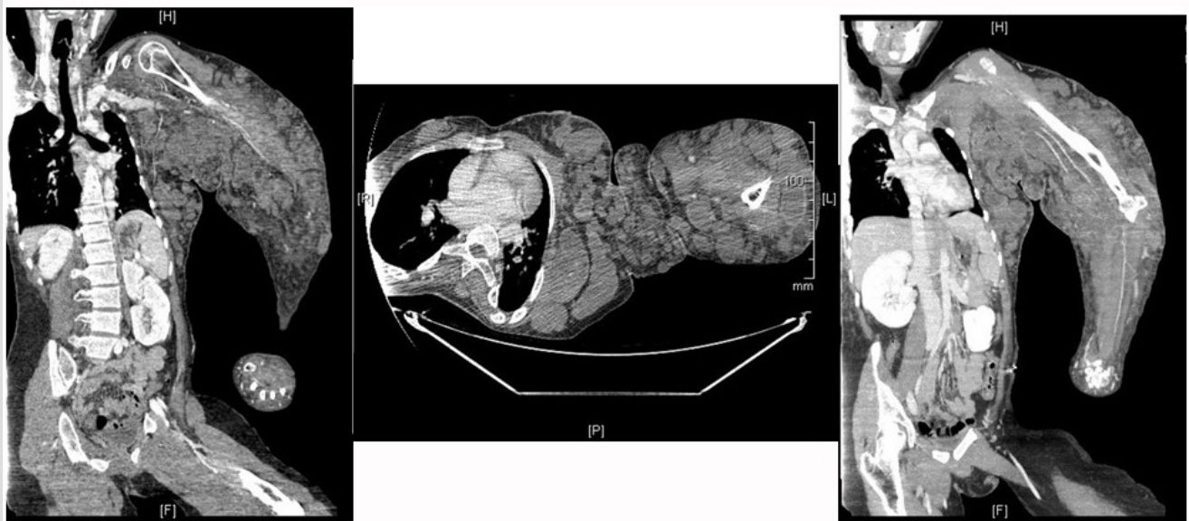
Figure 2. Excessive growth of the tissues of the left upper limb, resulting in gigantism and compression of the chest wall

Blood investigations showed leucocytosis, normocytic, normochromic anaemia (Hb 11.9 g/dl) and elevated D-dimers (4029 ng/ml). Doppler echocardiography of the vessels in the arm showed multiple tortuous varicose structures with phenomena of significant thrombosis; angio-CT revealed a subclavian vein slightly enlarged, with occlusion of the left brachiocephalic venous trunk and the internal jugular vein. Signs of lymphoedema were observed distally. A small deformation of the long bones was seen, with slightly irregular contours. The patient was admitted and anticoagulation with enoxaparin in therapeutic doses was started, with improvement in his condition.