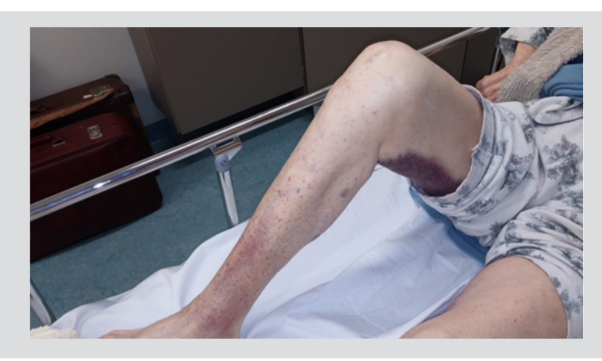
Figure 1. Clinical presentation: petechiae and ecchymoses on the dorsal side of the right leg

The particular clinical aspects and dietary history led to the clinical diagnosis of symptomatic scurvy caused by vitamin C deficiency. The patient's serum ascorbic acid level was undetectably low. She was treated with 500 mg ascorbic acid daily, after which the ecchymoses improved dramatically within 5 days. Further analysis by a psychiatrist revealed delusional conceptions concerning food intolerance, possibly explained by a delusional disorder or schizophrenia.