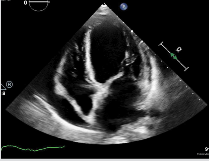
Figure 2. Transthoracic echocardiogram on admission showed a left ventricular ejection fraction of 35–40%, global hypokinesia with a moderate–large pericardiac effusion, and inspiratory right ventricular collapse concerning for cardiac tamponade