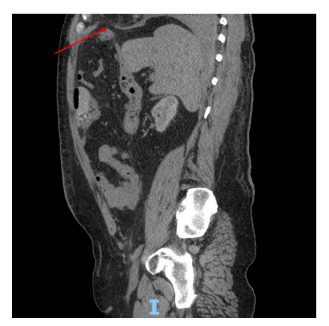
Figure 4. Non-contrast computed tomography of the abdomen/pelvis. The arrow points to the right-sided diaphragmatic defect