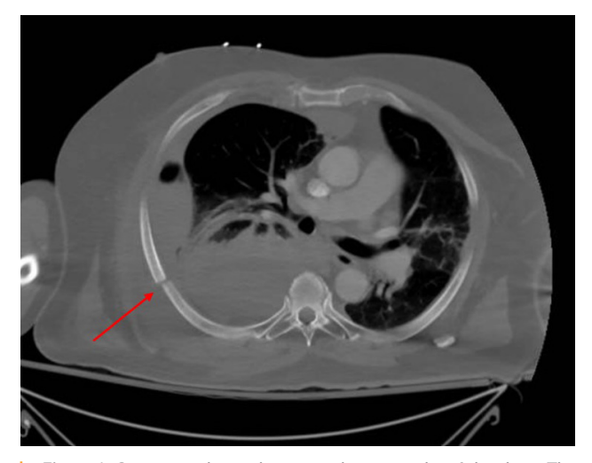
Figure 1. Contrast-enhanced computed tomography of the chest. The arrow points to the right seventh rib fracture. A large pleural effusion is also seen

He presented to our hospital 16 days after discharge with worsening shortness of breath, persistent cough, dizziness, and right-sided abdomen and chest pain. He was haemodynamically unstable with increasing oxygen requirements. His physical examination was significant for bruising along the right upper abdominal wall extending below the umbilicus as well as mid to lower back. A CT of the chest with IV contrast was ordered emergently. Significant findings included the presence of a large right pleural effusion ( Fig. 1 ) and a large upper right ventral hernia ( Fig. 2 ).