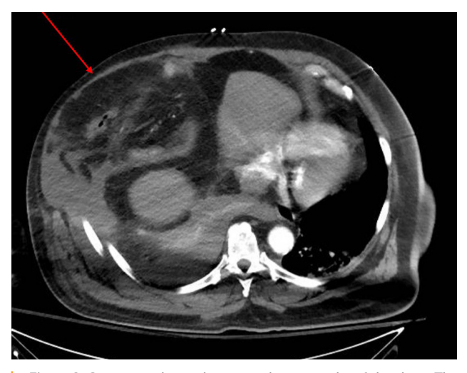
Figure 2. Contrast-enhanced computed tomography of the chest. The arrow points to the right-sided ventral hernia