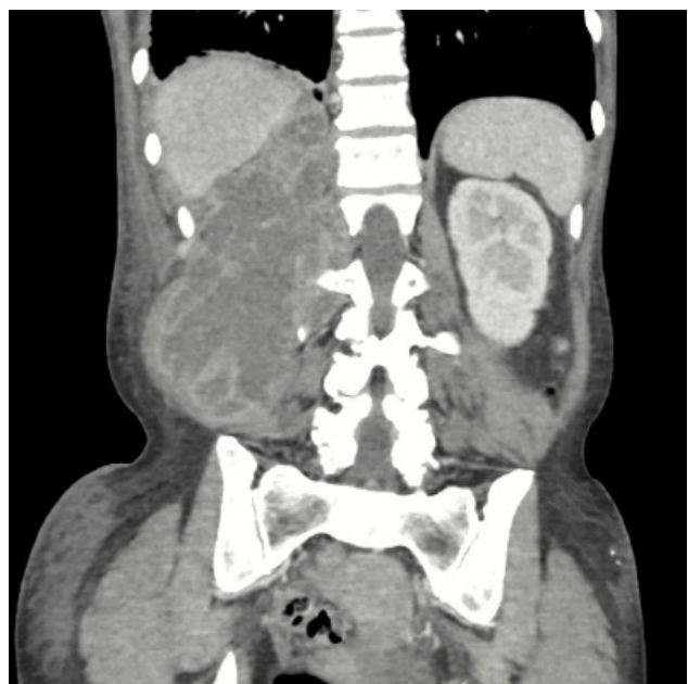
Figure 2. Pre-drainage image