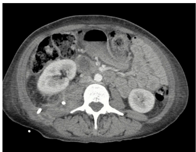
Figure 3. One post-drainage image

the typical demographic our patient was a female in her 40s with no prior medical history, who formed a sizeable retroperitoneal abscess.