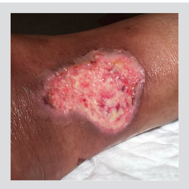
Figure 2. Close-up view of the ulcer

Laboratory results showed normochromic normocytic anaemia (haemoglobin 9.3 g/dl), without vitamin or iron deficiency, CPR 10 mg/dl without leucocytosis, mild renal failure with stable plasmatic creatinine of 1.97 mg/dl, and normal calcium.